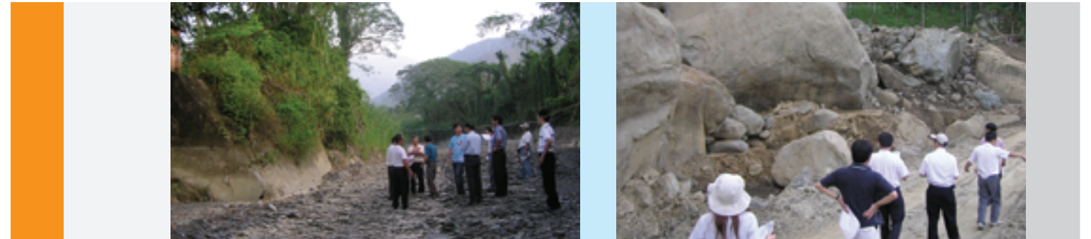
圖17：南投卡玫基及鳳凰災後復建水利工程 Fig. 17: Reconstruction of irrigation works in Nantou County after typhoons Kalmaegi and Fung Wong